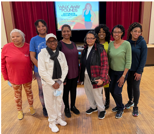
The walking group meets at the Community House.

Like and follow the group on Facebook at https://www.facebook.com/walkintheparkgroup .